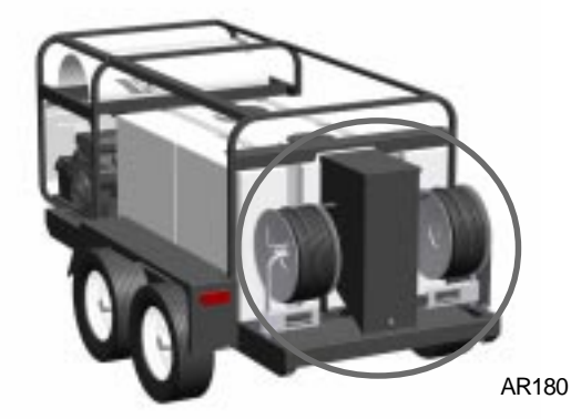
AR181 or AR182