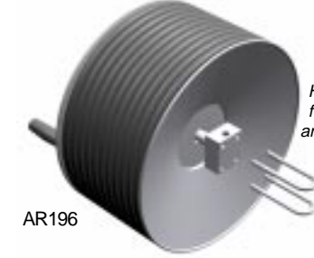
Hose reel drums are made from 14GA stainless steel and will not compress under contraction of hose.