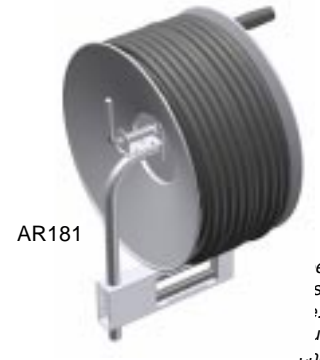
HOSE REELS FOR TRAILERS

AR180 Hose Reel Stainless HP R Arm 100ft of 3/8" AR181 Hose Reel Stainless HP L Arm 100ft of 3/8" Hose Reel Stainless LP L Arm 100ft of 5/8" AR182 AR191 Hose Reel Stainless HP R Arm 300ft of 3/8" AR192 Hose Reel Stainless LP L Arm 200ft of 5/8"