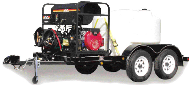
AW-9000-0002 shown with hot water unit and hose reels (all sold separately)